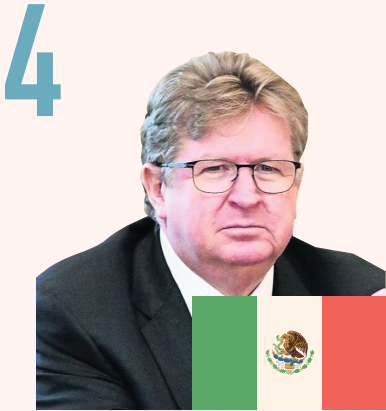
GERMÁN LARREA MOTA-VELASCO $25.9B