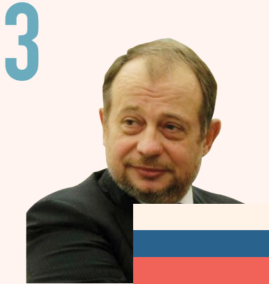
VLADIMIR LISIN $26.2B