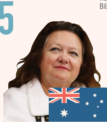
GINA RINEHART $23.6B