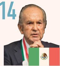
ALBERTO BAILLÈRES $9.2B