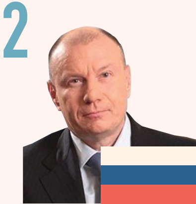
VLADIMIR POTANIN $27.0B