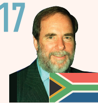
NICKY OPPENHEIMER $8.0B