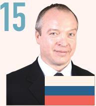
ANDREI SKOCH $8.6B