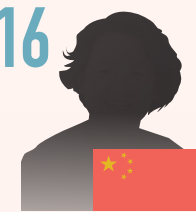
ZHENG SHULIANG $8.6B