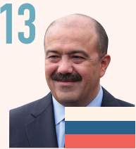
ISKANDER MAKHMUDOV $9.7B