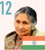
SAVITRI JINDAL $9.7B