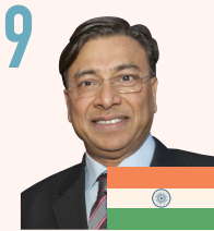
LAKSHMI MITTAL $14.9B