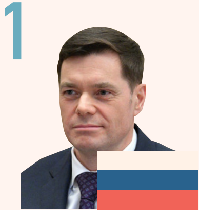
ALEXEY MORDASHOV $29.1B