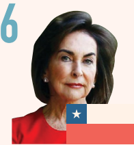
IRIS FONTBONA $23.3B