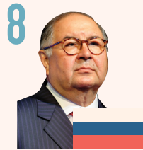
ALISHER USMANOV $18.4B